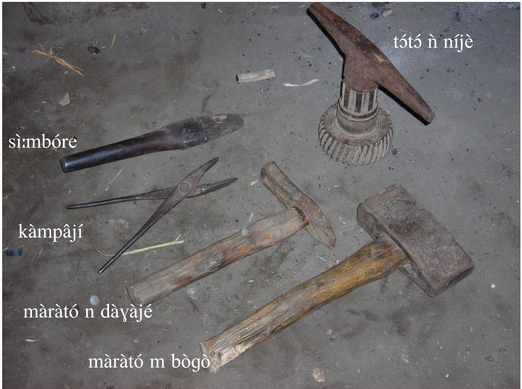
tótó n níjè